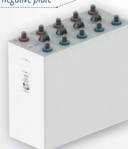
PIBAS® Avantgarde Modular High Capacity Single Cell